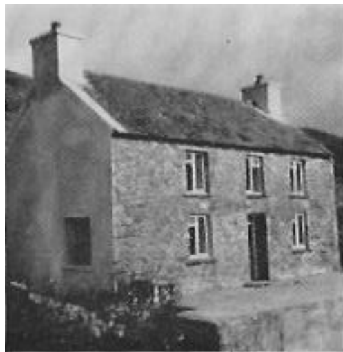
Front cover of the April 1967 issue, and a photo inside the issue.